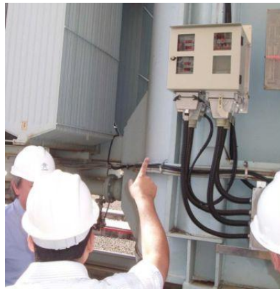
Figure 1- IEDs on the tank of ASEA transformer

A few IEDs placed on the casing of the transformer, as shown in figure 1, while others are located in a common panel for the bank. In the case of phase A, the ASEA transformer received a retrofit with IEDs being installed to replace the former electro-mechanical devices, such as mechanical thermometers for oil and winding temperatures. IEDs with control functions were also integrated into the monitoring system. The full list of IEDs installed in each point can be seen in Table 2.