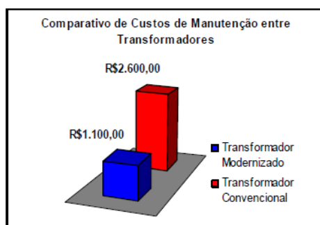
Figure 2 shows maintenance costs involved in the four-year period, for both transformers in the substation. As can be seen on the chart, by modernizing the systems, a cost reduction on the order of 60% in comparison with the conventional system was obtained. Another point to be highlighted are the ambient conditions found on the substation site, with ambient temperatures above 35 C and relative humidity of the air in the 60% to 80% range, most of the time.