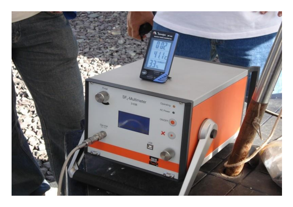
Figure 2 – Even in shadowed areas, the temperature during the researches frequently reached levels above 40°C

In this context, attention must be also paid on the fact the high temperatures can lead to early aging of the electronic components when the maximum operating temperature of IEDs is not correctly specified. As an example, we take the document "Technical Notes For Electrolytic Capacitor" [2], of the capacitor manufacturer Rubycon Corporation, which shows how "The lifetime of electrolytic capacitors made of aluminum depends on the temperature, and doubles when the temperature decreases by 10°C, based on the Arrhenius Law" (our translation). This principle can be used to estimate the durability of electronic devices, such as IEDs, when submitted to high temperatures, in a similar way as used for calculating the lifetime of transformers.