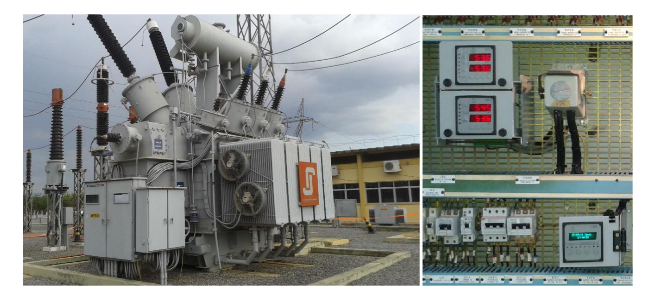
Figure 5 – Transformer at Nova Mutum SS and IEDs installed inside the panel

Shown in the image below is a 230/69kV 30 MVA transformer at the Nova Mutum substation. The IEDs chosen for its monitoring are located at right. The smart sensors for monitoring of oil and winding temperatures (top right), as well as the bushing monitor (bottom right), are installed inside the control panel of this transformer.