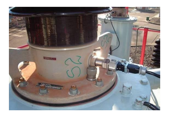
Figure 4- Direct connection of the monitoring system to the bushing tap of side [5]

In normal applications, where there is no BPD, the monitoring system is directly connected to the bushing tap in order to measuring the dielectric's fault current, and thus monitoring its capacitance and tangent delta changes. This application is shown in figure 4 below, where we see an adapter connecting the bushing TAP to the on-line monitoring system.